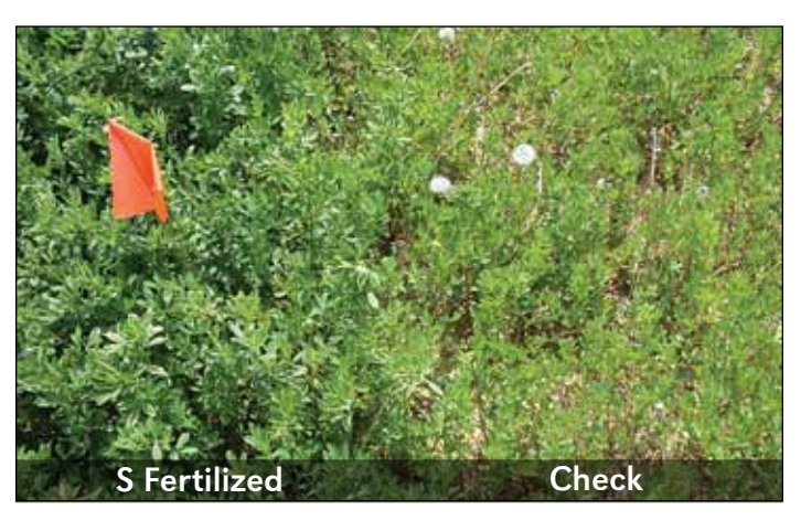
Figure 1. Alfalfa plant growth with and without S application, showing S deficiency symptoms of plant yellowing and poor growth in the non-S treated check.

Abbreviations: S = sulfur; N = nitrogen; P = phosphorus; K = potassium; ppm = parts per million; OM = organic matter; CaSO_4 \cdot H_2O = calcium sulfate (gypsum); (NH<sub>4</sub>)<sub>2</sub>SO<sub>4</sub> = ammonium sulfate (AmS).